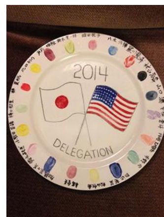
Commemorative plate made by the delegation

Seventh and eighth grade students of all CUSD schools are eligible to apply for the program each January. Once selected, the students meet weekly until leaving for Japan in late June, bonding as a group, learning about Japanese language and culture, and preparing a short group performance to give at the Japanese host school and reception banquet. In the fall, these students serve as hosts for the visitors from Toyokawa. For more information about the Cupertino Toyokawa Sister City program, now celebrating its 36th year, please visit: www.cupertinotoyokawa.org .