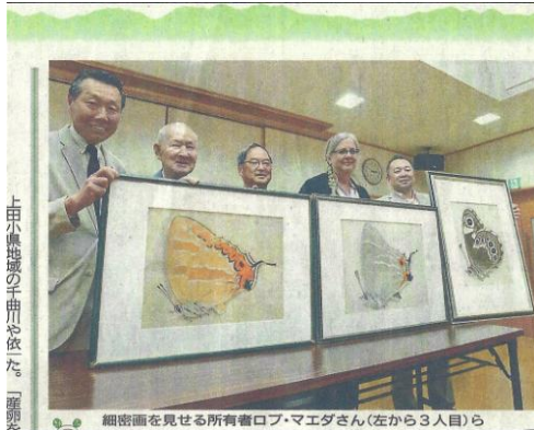
Newspaper clipping from press conference in Azumino City

By Robb Mayeda, Kawakami-Watsonville Sister City Association (Edited for length; continued from Issue 11)